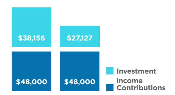
TFSA vs. Non-registered savings illustration

As illustrated above, investing in a TFSA resulted in $11,029 more in savings than if you invested the same amount in a non-registered (taxable) account.